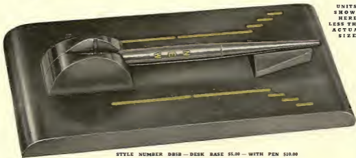
STYLE NUMBER DB5B — DESK BASE $5.00 — WITH PEN $10.00